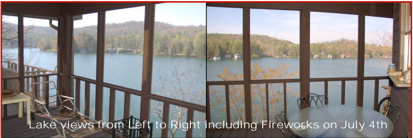
Lake views from Left to Right including Fireworks on July 4th