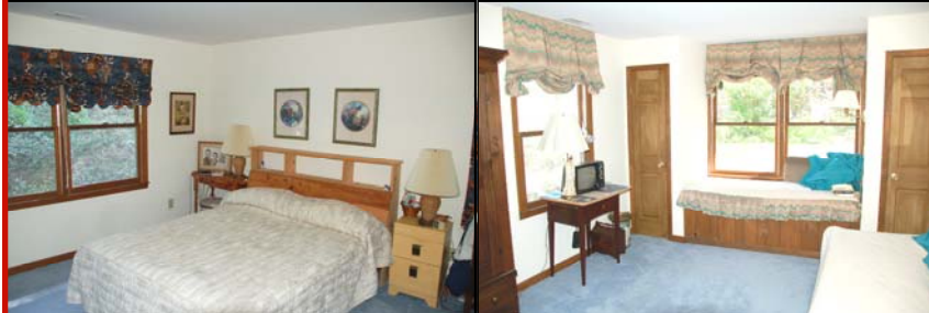
Master Bedroom, Bonus, 1.5 baths on Main Level