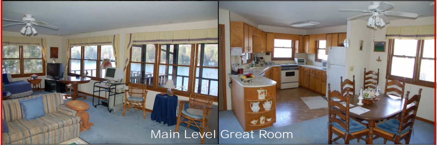
Main Level Great Room