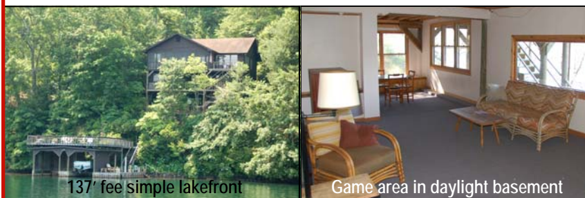
137' fee simple lakefront