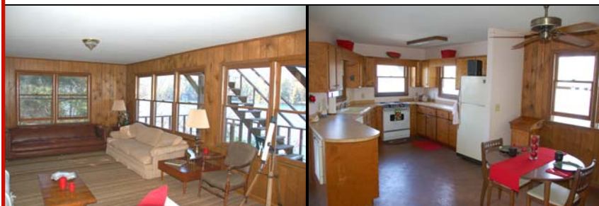
2 BR, 1.5 baths, 2nd Great Room w/Kitchen on Lower Level